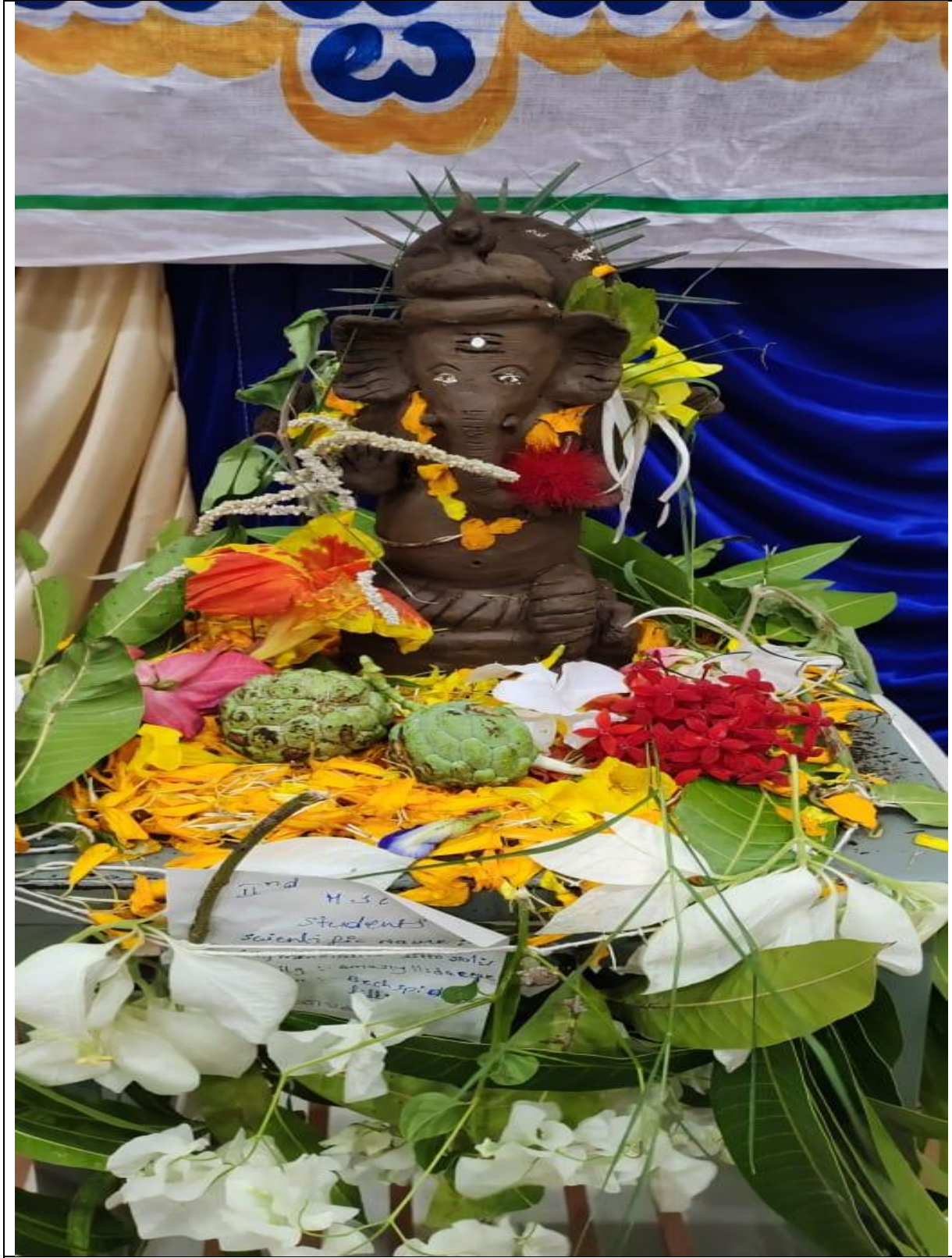
CLAY VINAYAKA BAGGED SECOND PRIZE