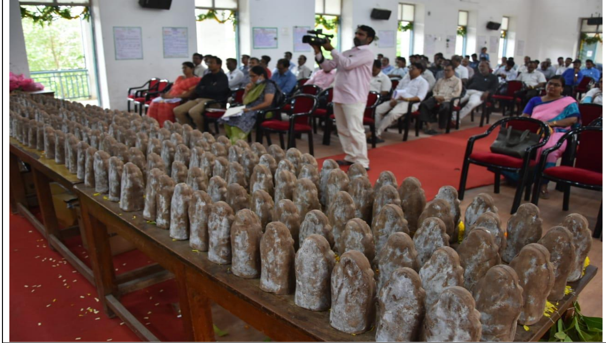
CLAY VINAYAKAS READY FOR DISTRIBUTION