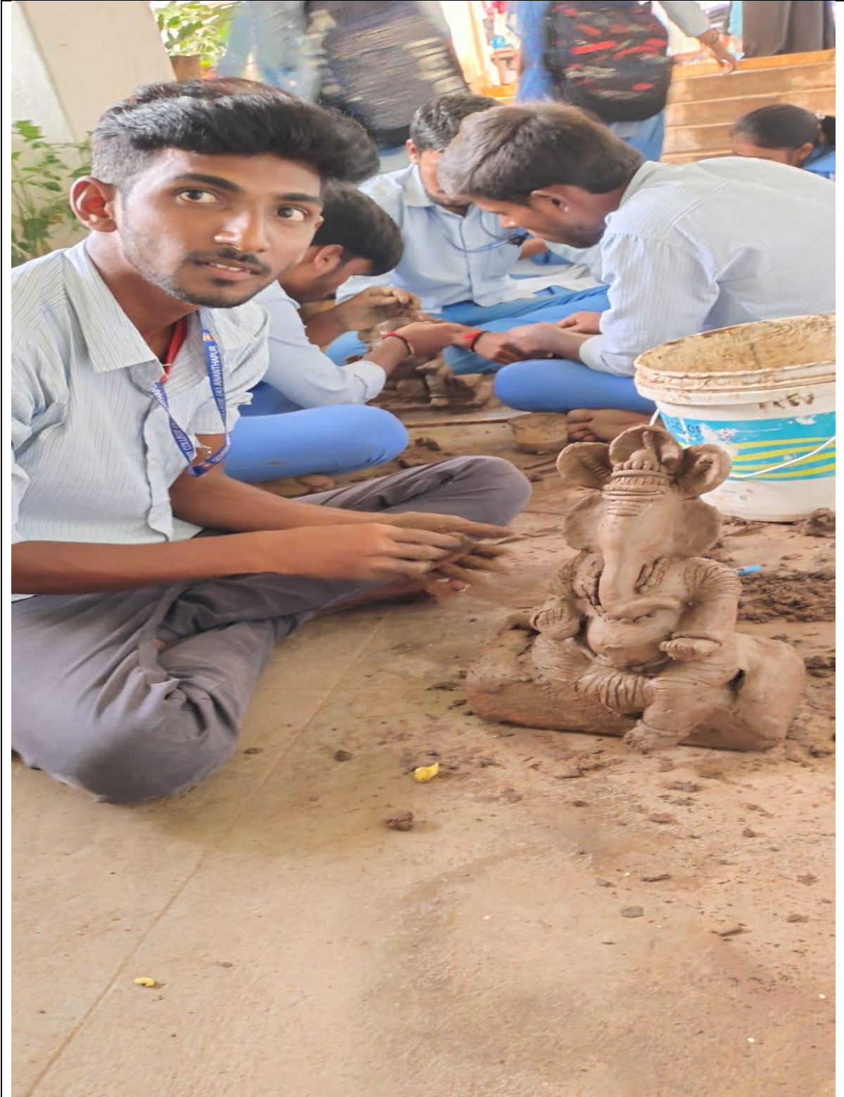
STUDENTS MAKING CLAY VINAYAKA